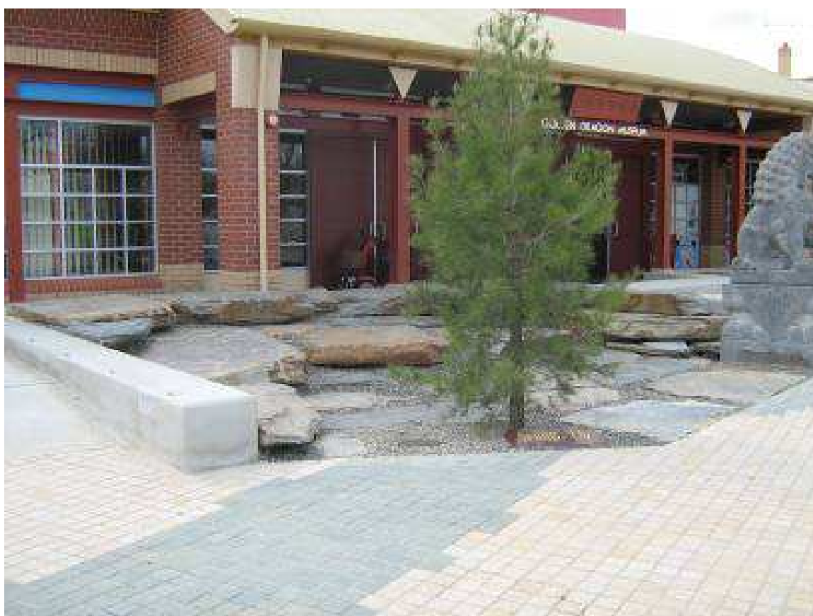
Pyrenees terracing stone, large steppers and crushed rock harmonise well in this garden feature at the Golden Dragon Museum in Bendigo.