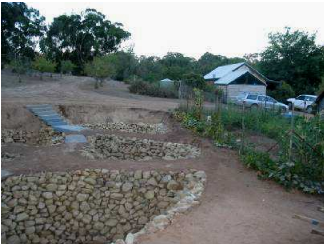
Another view showing the construction of the ponds use as a for water garden. Stone work by Glen Taylor.