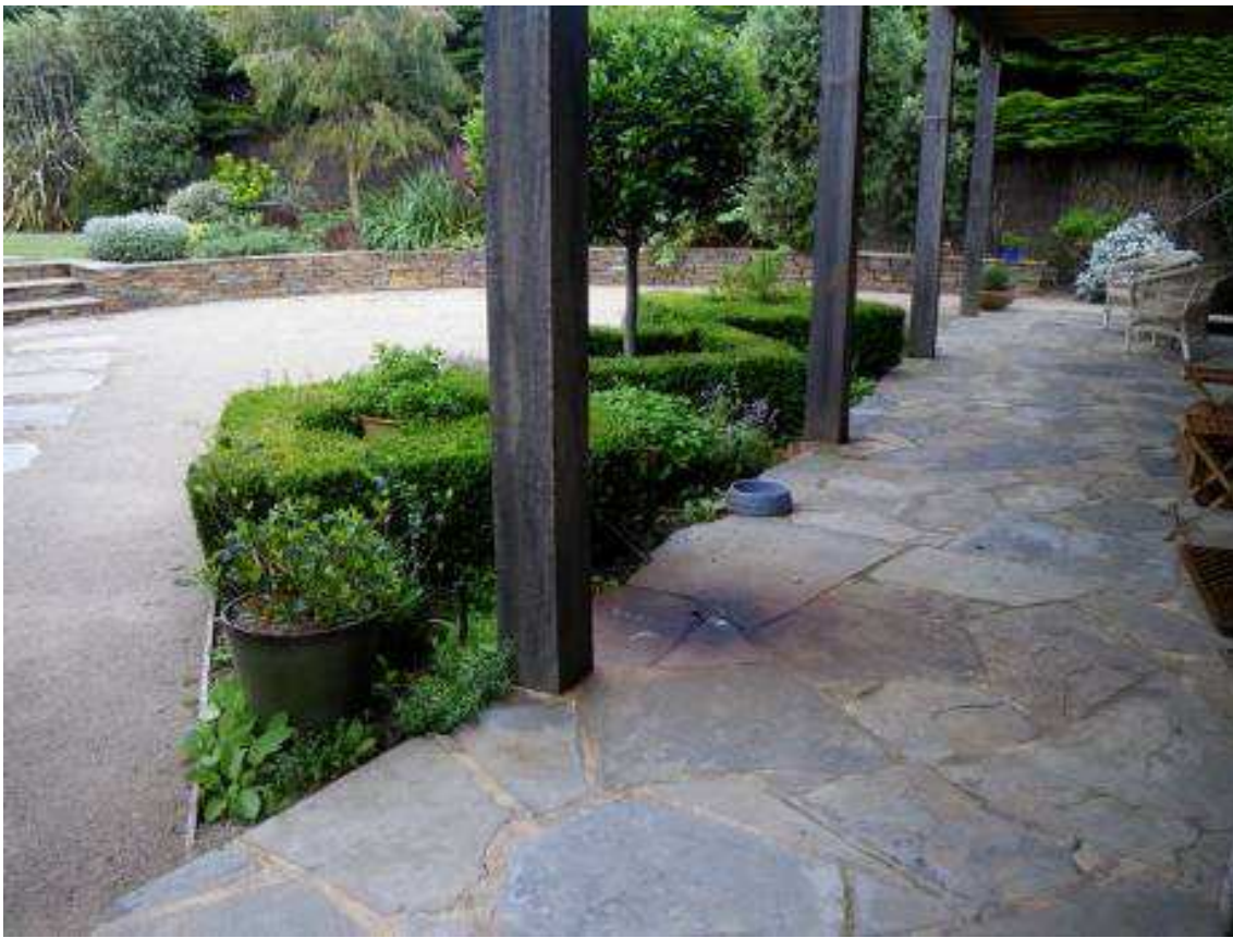
Pyrenees Seam S random slate paving covers a wide veranda that overlooks the formal courtyard. With stonework by David Swan Landscape Construction