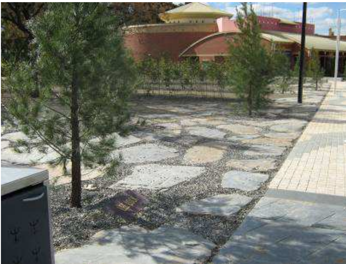
Pyrenees rock can be used in a multitude of ways. Here Ian Evans Creative Landscapes have used large Pyrenees stepping stones and crushed Pyrenees rock to border the area paved with Pyrenees pavers at the Bendigo Golden Dragon Museum to create a harmonious landscape. Polished red granite was also supplied by Pyrenees Quarries for the name plaques