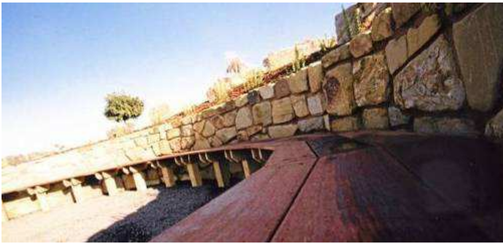
Landscaping by Luke Bullock Landscape Design and Construction of Bendigo, stone supplied by Pyrenees Quarries.