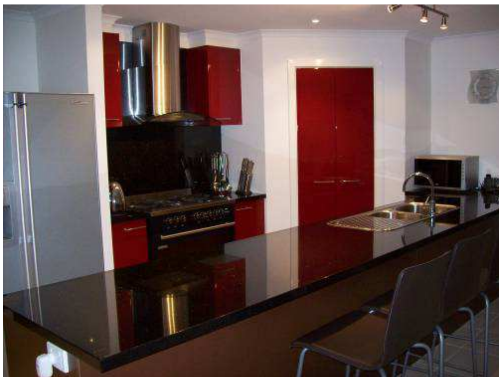
Fire engine red doors contrast dramatically with “Black Galaxy Premium” granite kitchen benchtops, benchtops manufactured and installed by Pyrenees Quarries Pty Ltd