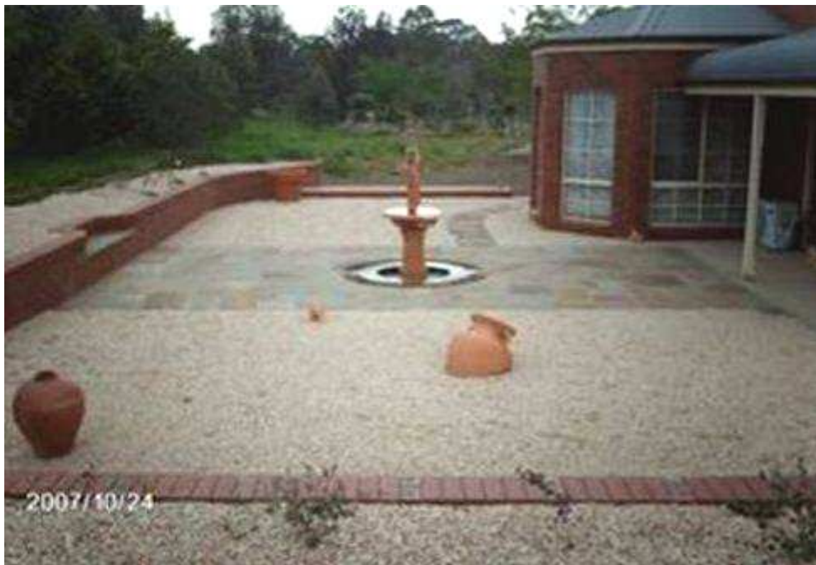
Random slate paving from Pyrenees Quarries provides an aesthetically pleasing surround to this pretty garden water feature at this home. Landscaping by Rob Schembri Gardening, phone 03 5474 3125 or 0438 732446