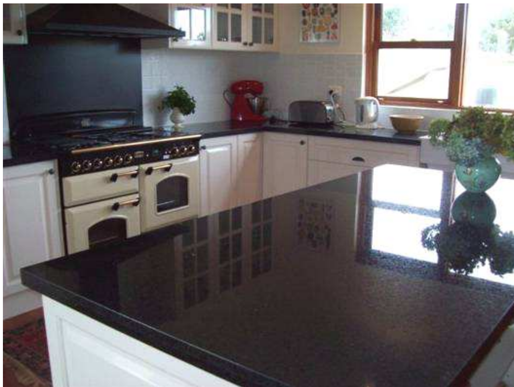
Kitchen built by Daco Kitchens and granite benchtops manufactured and installed by Pyrenees Quarries