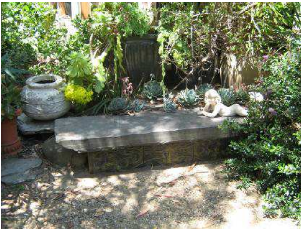
A seat made from a Pyrenees slab is tucked into a quiet corner of Darryl's garden.