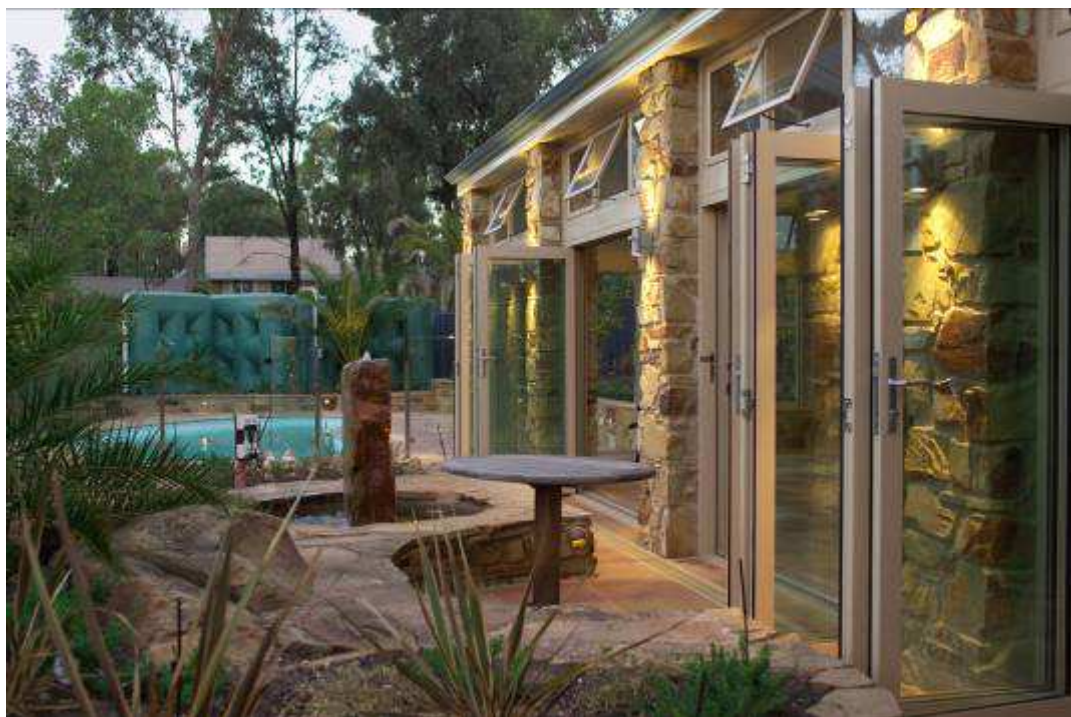
This easy-maintenance indoor-outdoor area created by Steve Pilcher Landscaping includes “Shivuri Pink” paving, a combination of Chooky Yellow and Yapeen building stone walls and a Yapeen feature stone in the pond.