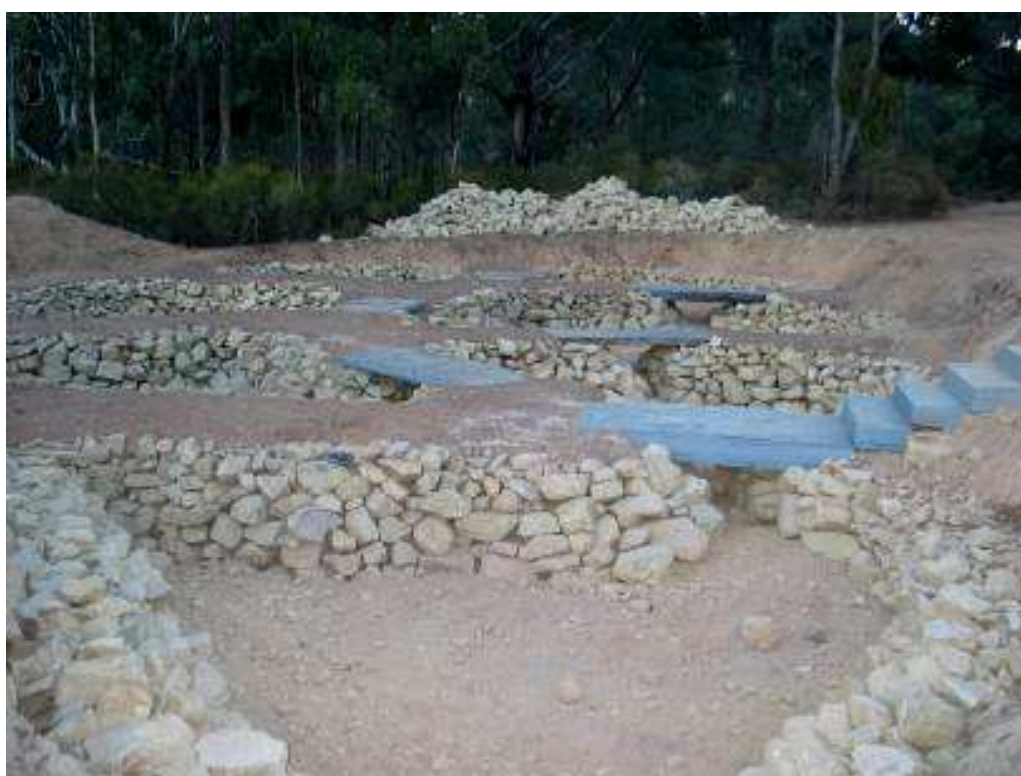
Water gardens in the making! Stonemason Glen Taylor has created a series of ponds of different depths, linked by Pyrenees slab bridges and lined with Chooky Yellow irregular building stone. When filled with water, stocked with fingerlings and planted with water loving plants, these ponds will create a green oasis in our dry bushland.