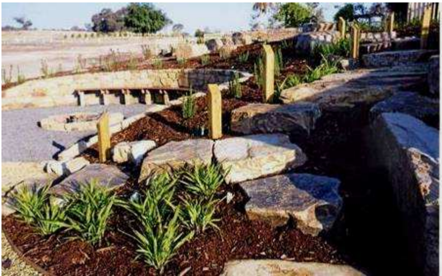
Cut into the side of a hill, this amphitheatre/entertainment area has been created using Yapeen feature rocks and select building stone. Landscaping by Luke Bullock Landscape Design and Construction of Bendigo, stone supplied by Pyrenees Quarries.