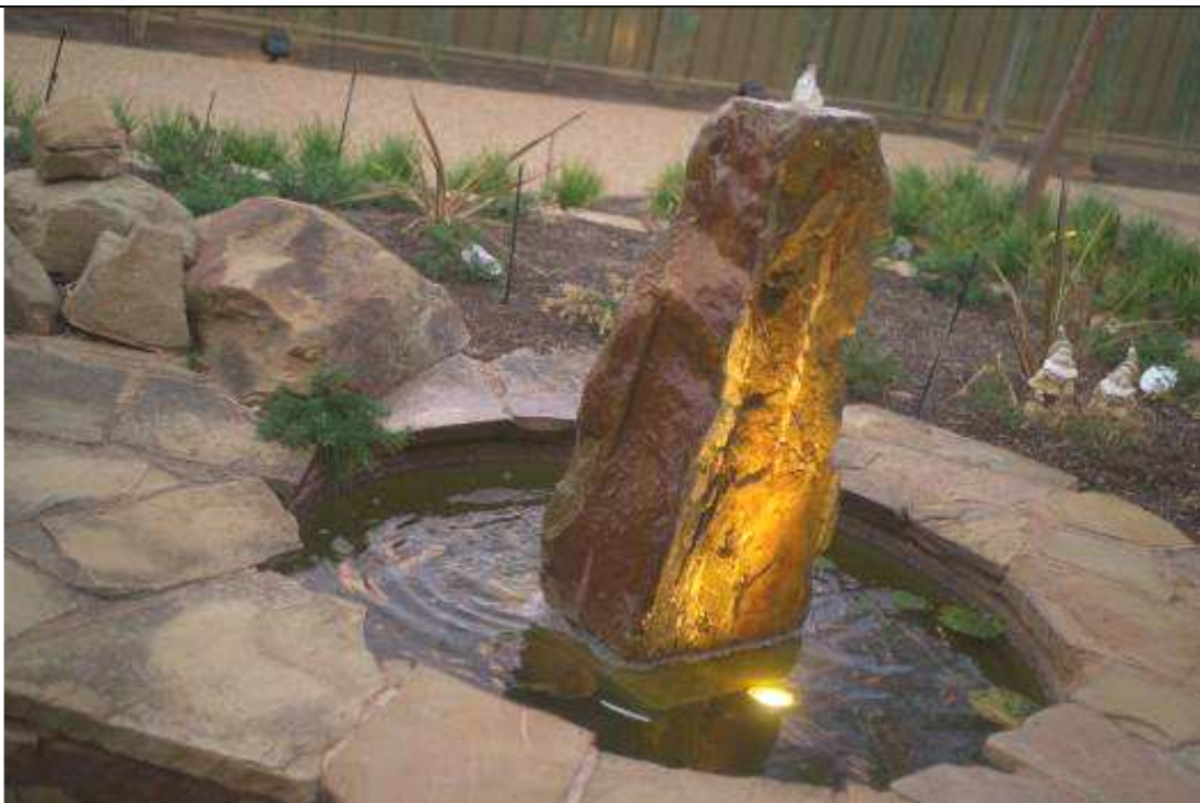
The use of a single Yapeen feature stone as a natural water feature creates a harmonious garden scene, especially when teamed with Yapeen landscaping stones and random paving. Stonework by Steve Pilcher Landscaping.