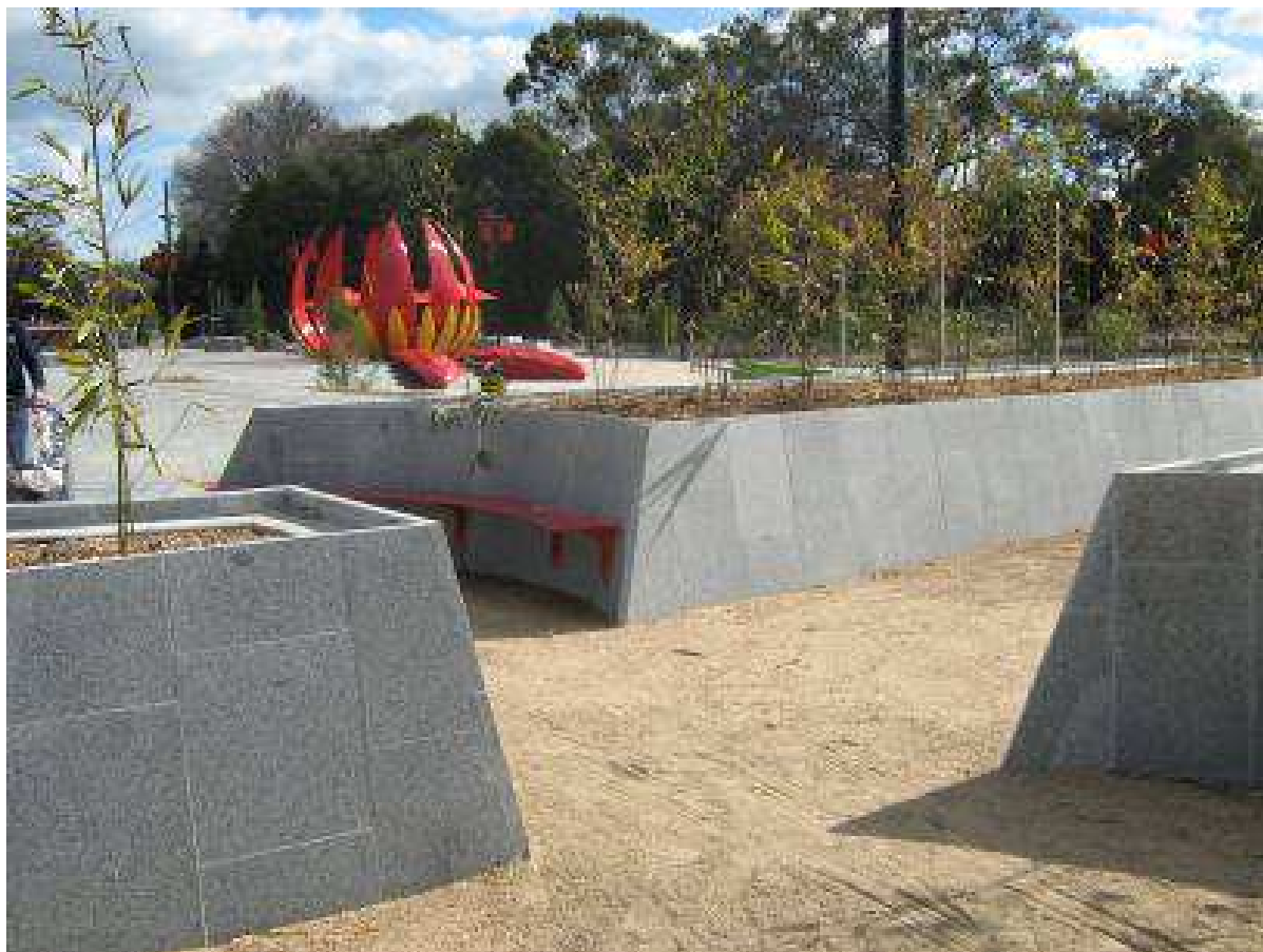
The Harcourt granite cladding on the raised garden beds walls was supplied cut to size by Pyrenees Quarries. Stonework by Ian Evans Creative Landscaping of Bendigo.