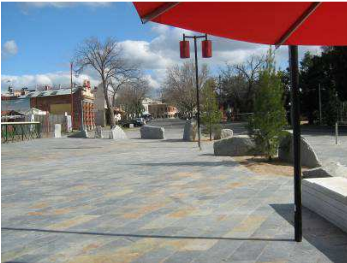
Harcourt granite tors co-ordinate beautifully with Pyrenees paving at the Golden Dragon Museum in Bendigo.