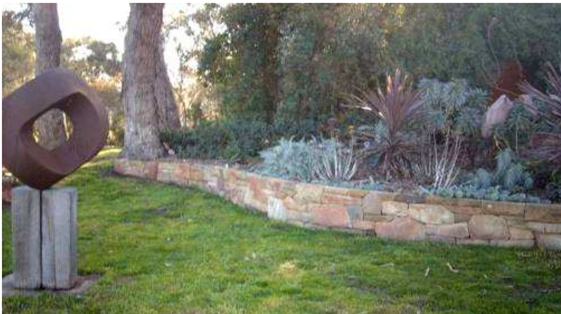
A sinuous retaining wall of Chooky select building stone winds around this garden bed. Landscaping by Rob Schembri Gardening, phone 03 5474 3125 or 0438 732446