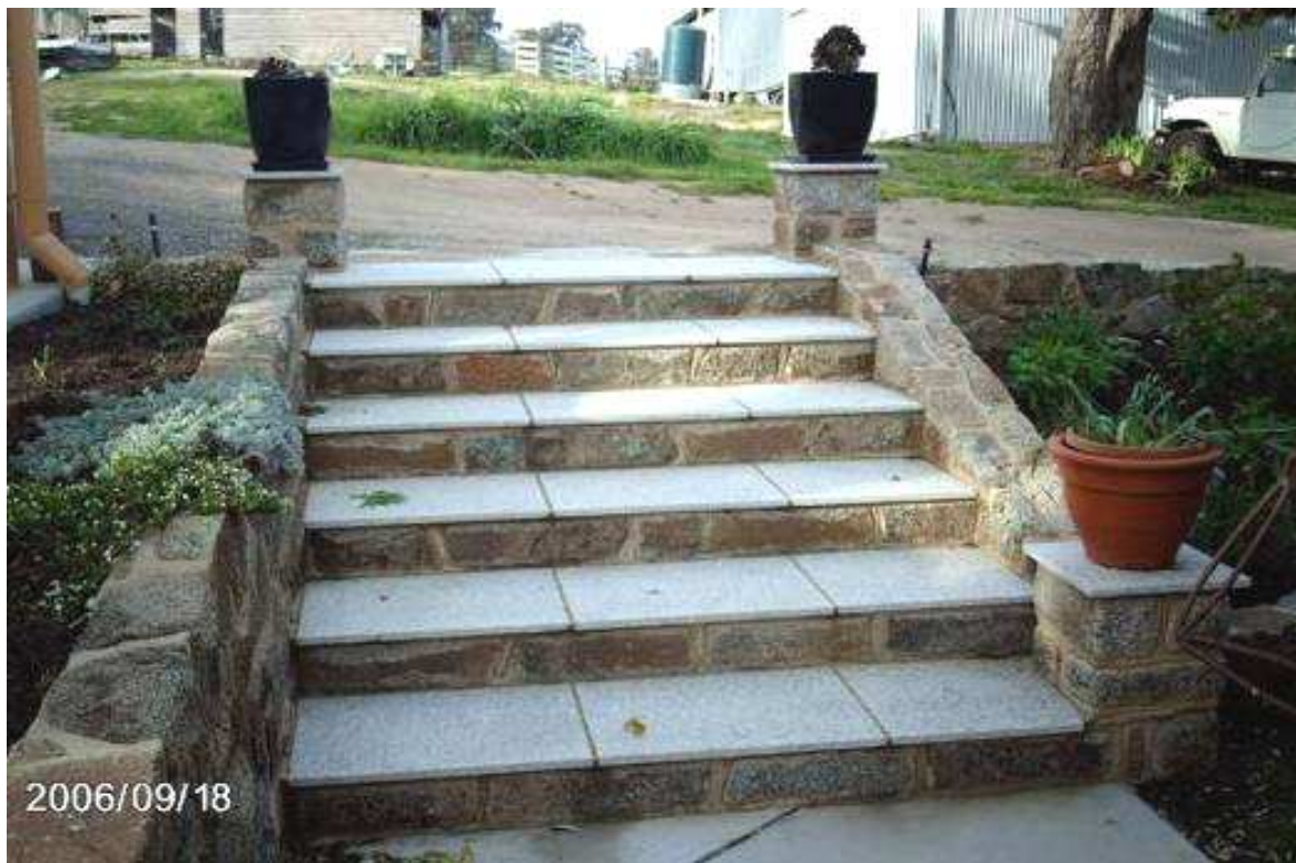
Stone steps made from Kota limestone and risers and stringers constructed in Yapeen selected building stone provide an inviting entrance to another garden level, stonework by Rob Schembri Gardening, phone 03 5474 3125 or 0438 732446