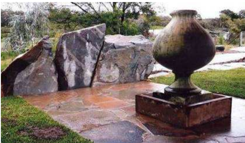
Large Pyrenees feature stones nestle together to backdrop this garden feature with Castlemaine slate paving forming the pathway. Landscaping by Luke Bullock Landscape Design and Construction.