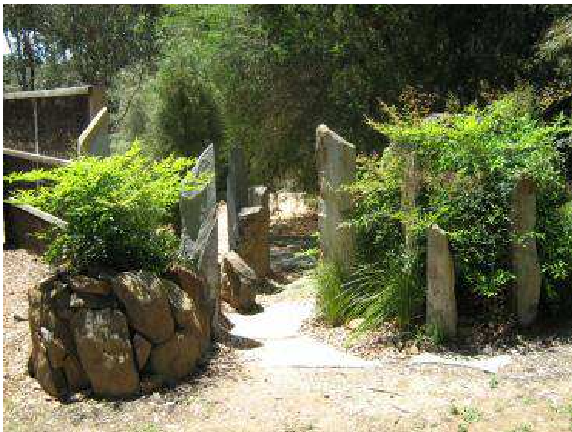
Pyrenees shards form a small group of standing stones each side of the pathway in Darryl's garden