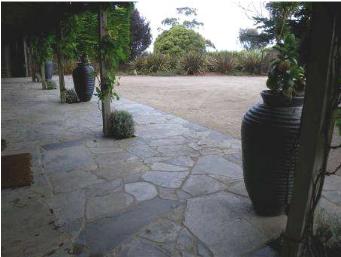
A different view of the Pyrenees Seam S random slate paving on this magnificent veranda. Stonework by David Swan Landscape Construction