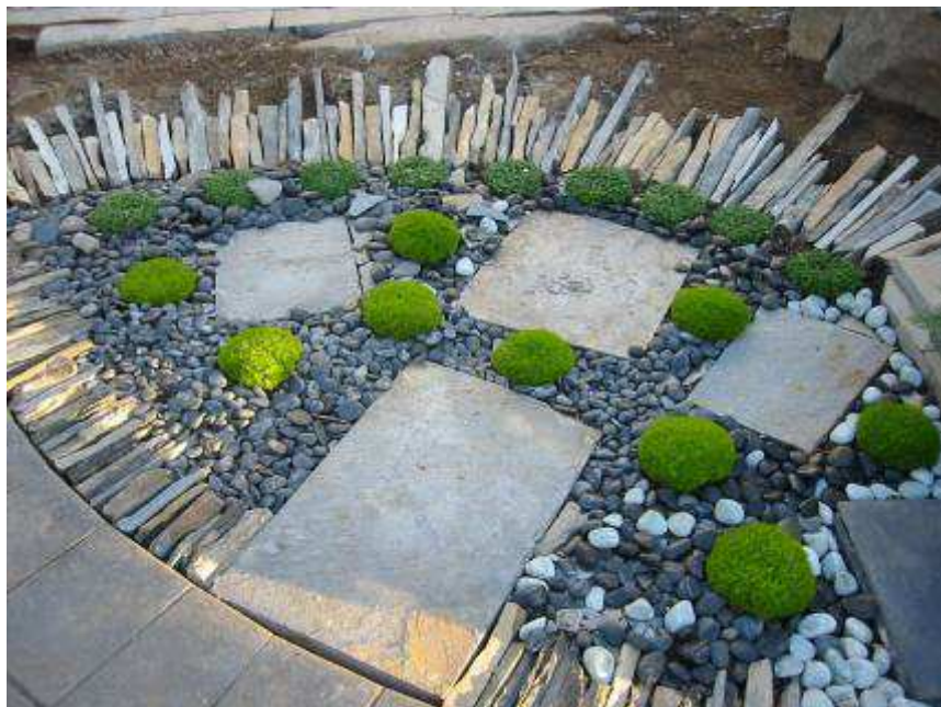
An eye-catching garden feature bed, built with Pyrenees Stone, in private garden, Bendigo. Stone work by Justin Carr Landscaping of Bendigo. Phone 0411 143097