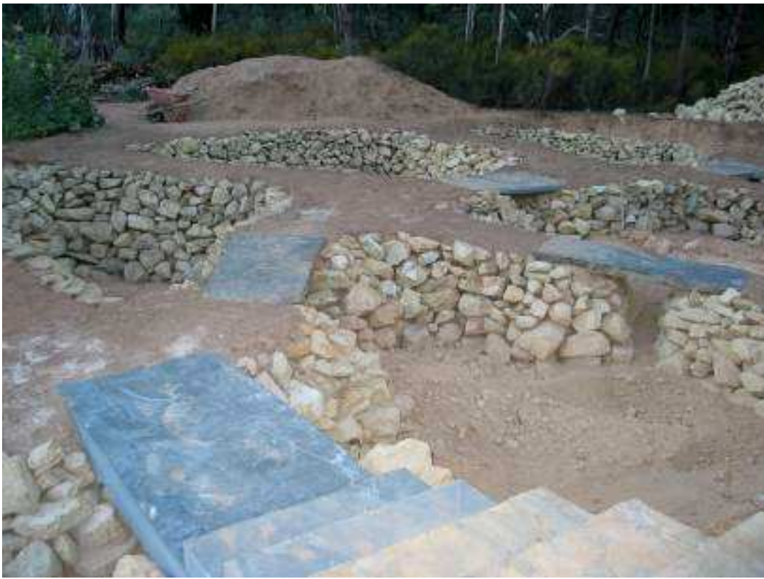
Another view of the water gardens under construction showing steps and bridges created from Pyrenees slabs and steps and Chooky irregular building stone. Stone work by Glen Taylor