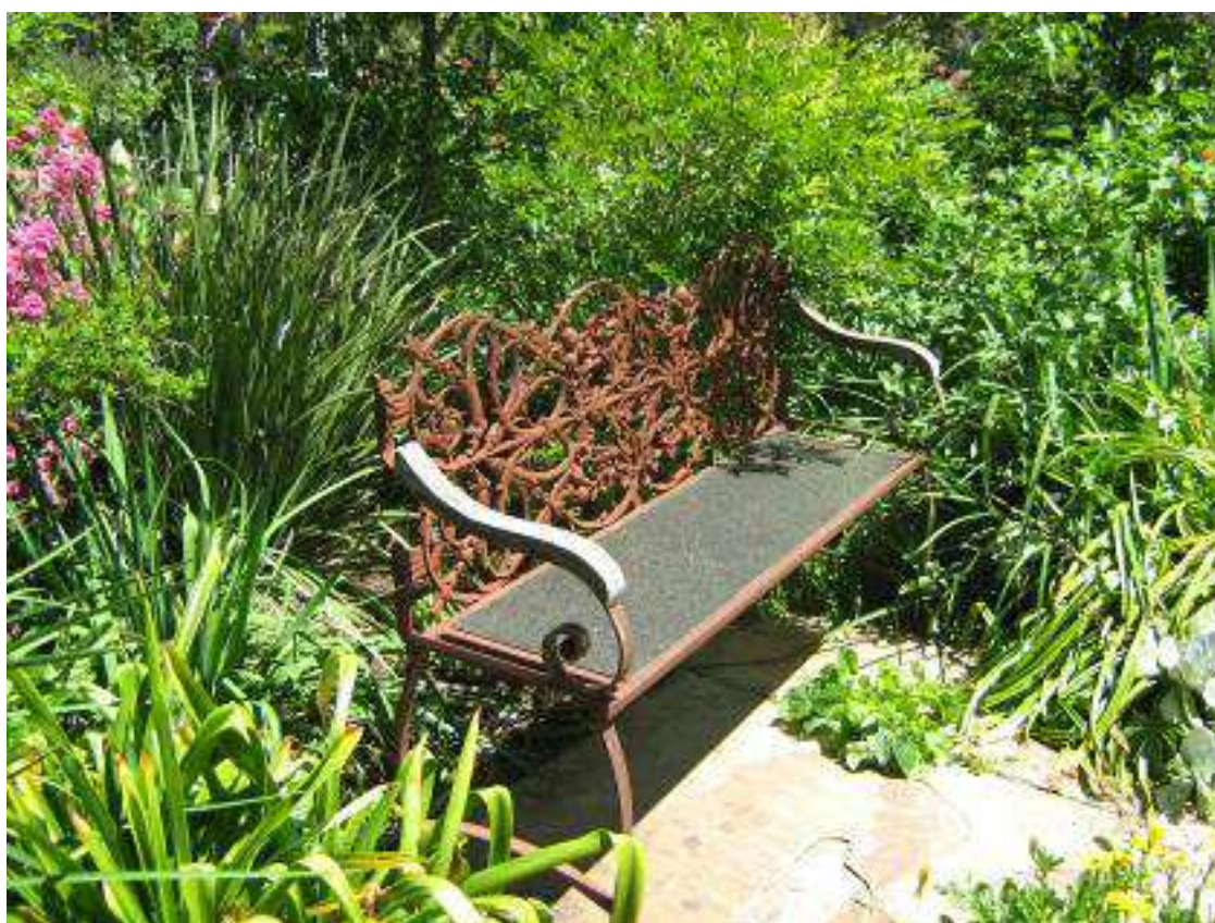
A bower-bird from way back, Darryl has used a piece of honed "Adelaide Black" granite as a seat insert in this antique cast iron frame which huddles into the lush growth.