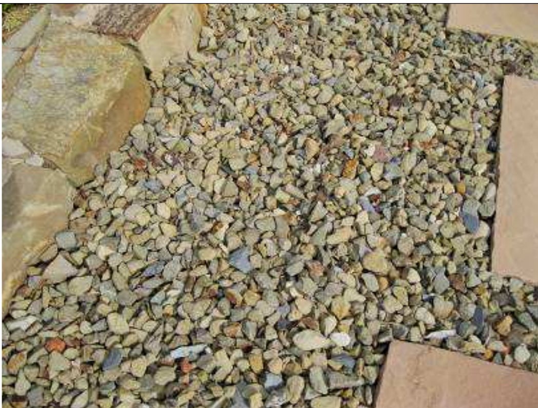
Pyrenees Quarries produce a matching sand stone pebble mixture that matches their building stone. Here, weeds are kept to a minimum by using the crushed stone, with Latipur Yellow sandstone pavers as stepping stones, along the side of a house