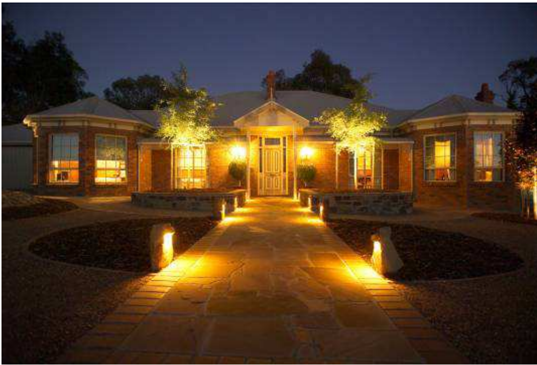
“Shivuri Pink” random paving creates an impressive entrance path to this home. Stonework by Steve Pilcher Landscaping