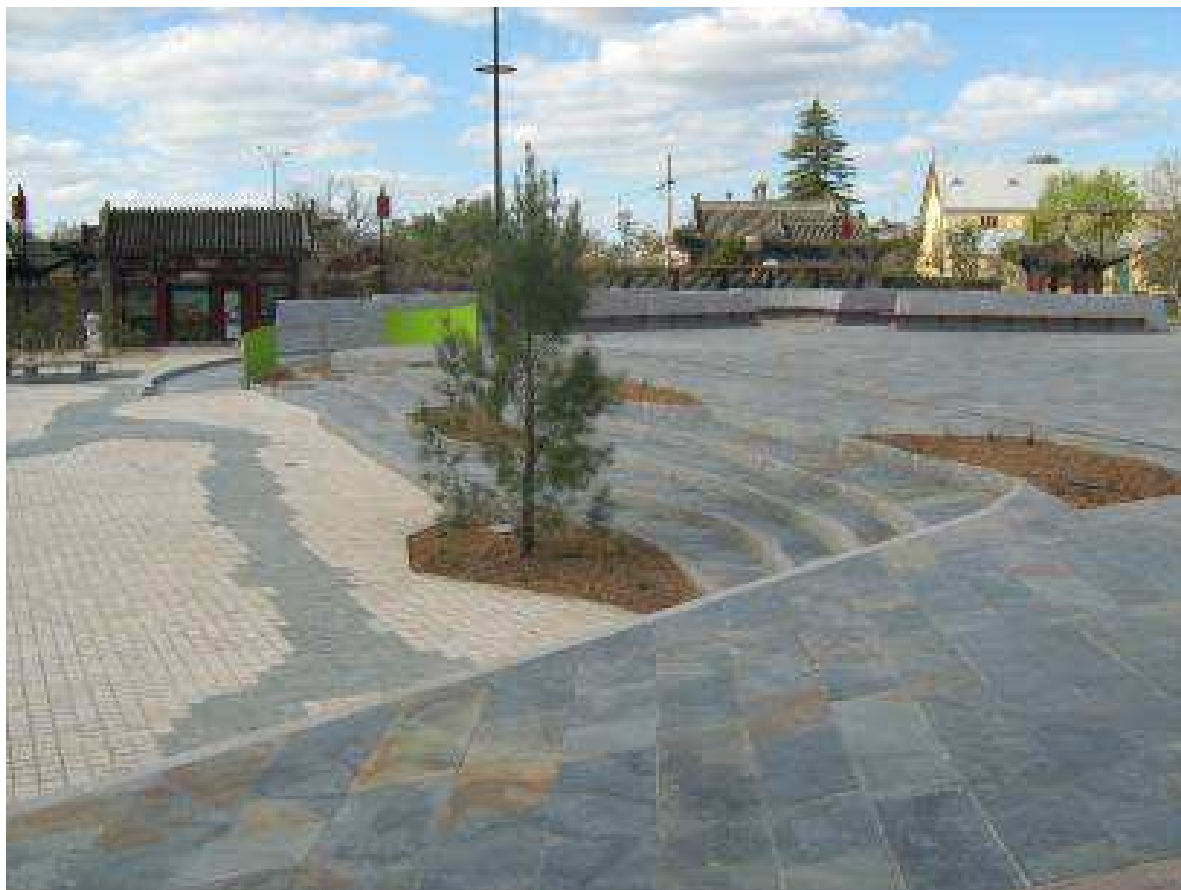
Pyrenees paving and steps shown here with Harcourt granite clad walls in the background – Central Victorian stone used locally! Stonework by Ian Evans Creative Landscapes